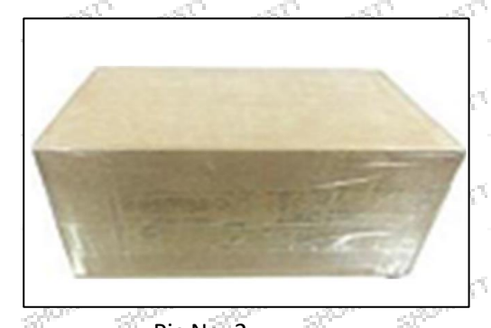
Pic No. 2 Domestic express packaging:

Minors are prohibited from using transparent tape, yellow tape, black wrapping protective film, and white wrapping protective film to avoid personal injury.